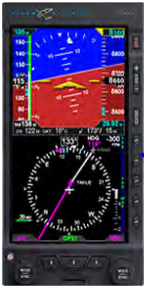
EFD1000 Primary Flight Display